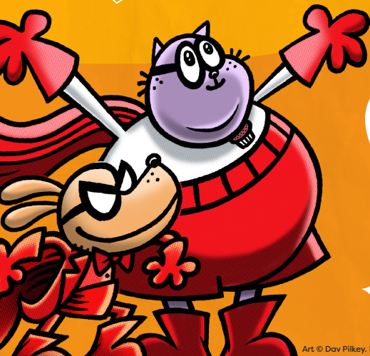
Art. © Dav Pilkey, DOG MAN TM/© Dav Pilkey.

A pop-up book-store with hundreds of books from JUST £2.99